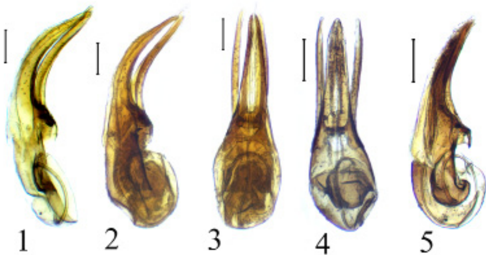
Fig.1–5. — Male genitalia of Syntomium spp. 1–3. S. marusiki Ryabukhin, 1992 (1: Ust'-Urgal, 2–3: Levaya Bureya River): aedeagus (1–2: laterally, 3: ventrally). 4–5. S. japonicum Watanabe et Shibata, 1960 (Tokyo): aedeagus (4: ventrally, 5: laterally). Scale = 0.1 mm.

The lanceolate median lobe is moderately incurved dorsally, about as long as parameres, with an indistinct preapical keel on the dorsal side. The endophallus is represented by the paired medial longitudinal bands conjoined distally, with feebly sclerotized scattered internal denticles and fringe of rather dense but vague cilia; a long thin flagellum, coiled in a